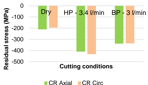
Figure 3: Residual stress

The last part of this study focuses on the influence of liquid nitrogen parameters on surface residual stress. Indeed, in dry machining the level of residual stress does not exceed -200 MPa. However, it reaches -330 MPa at low pressure (3 l/min) and -433 MPa at high pressure (3.4 l/min). Figure 4 shows these results.