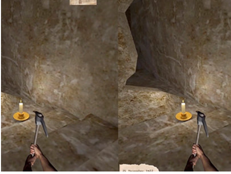
Figure 4: A screen shot of the “King Tut VR2” (Copyright ©, EON Reality, Inc) application in the HMD Mobile device

3.2.4 Task. The experiment consists of the use of the edutainment “King Tut VR2” application designed by the EON Reality SAS company. The goal of the “King Tut VR2” VE application (see Fig. 4) is to relive the journey of Howard Carter and his discovery of King Tutankhamun’s tomb. The participants were asked to follow the instructions given by the voice-over in the VR application. The tasks covered passive activity (i.e., watching and listening to Howard Carter’s journey) and active activity (i.e., excavating with a pickaxe in the ground).