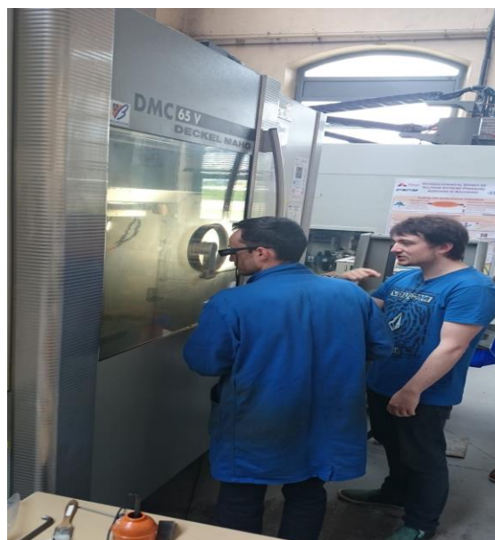
Fig. 5. A participant evaluating the application

We made a pre-user test with 5 participants, all of them use machine tools regularly (several times per week) but none of them are familiar with AR systems. We asked them through interviews to evaluate the usability of the system (“did you find the system easy to use?”), in terms of software and hardware manipulation (“did you find the user interface easy to handle?”), ergonomics (“how did you feel with the devices?”) and utility (“do you find the system useful?”, “would you use it every time?”). They were able to give also free comments. To answer the questions, a 10-point Likert scale was provided. We proposed two different devices: a tablet PC, needing however to hold it all the time, and EPSON Moverio BT-200 AR glasses, allowing participants to keep their hands free for other tasks. Both devices ran Android OS. No indication on how to use the system was provided to participants, to check its ease of use. The machining process to be executed was basic milling between two positions without any work piece. The process was performed on a DMC 85V machine tool. Participants had to launch the AR application, select the right machine tool, ask for specific parameters to be displayed, such as the tool position and cutting speeds, and supervise the machining process over the AR system without looking at the machine-embedded control screen (figure 5). Interviews were done at the end of the machining process.