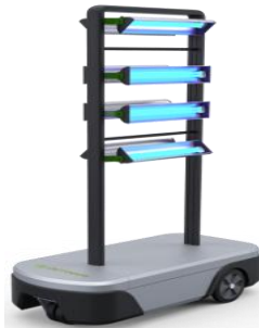
Figure 1 UV-Robot, by “Octinion”.

UV-robots will be developed to move through different crop types. For each crop type, a specific version of the robot will be designed to treat mildew in a typical greenhouse cultivation system. To stabilize the UV lamps when driving through the crop an adapted suspension should be implemented to deal with soil undulation. An autonomous localization system will be integrated into the robot; this will make it possible for the robot to move through the crop along a pre-set path. Each robot needs to optimally treat the cultivation with UVc-light. A unique system will be delivered to autonomously localize the robot.