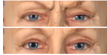
Figure 1: Contraction and dilation of pupils

H2: Expressive wrinkles combined with pupil dilation promote the recognition of emotion on an expressive virtual human by the user.