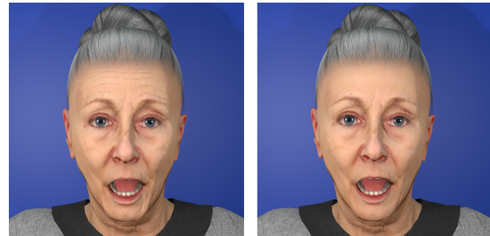
Figure 2: With or without expressive wrinkles