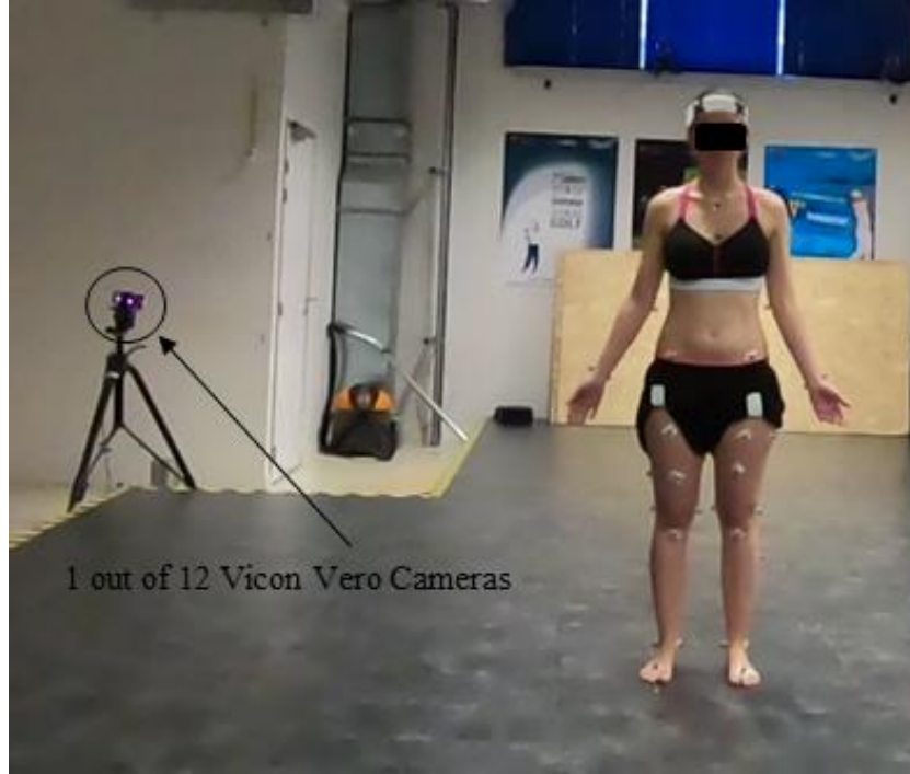
Figure 1. One of the subjects standing in front of the stereo vision system (This image has been taken by the left camera of the stereo vision system).