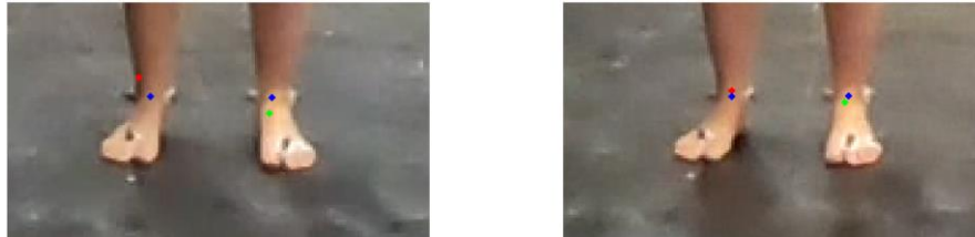
Figure 3. 2D estimation of the ankle joints for a single frame. The red, green, and blue dots, represent the estimation of the right ankle, left ankle, and the reference values, respectively.

respectively. This occurrence is because of the false 2D detections of the HPE method for several frames of the static acquisition for one of the subjects.