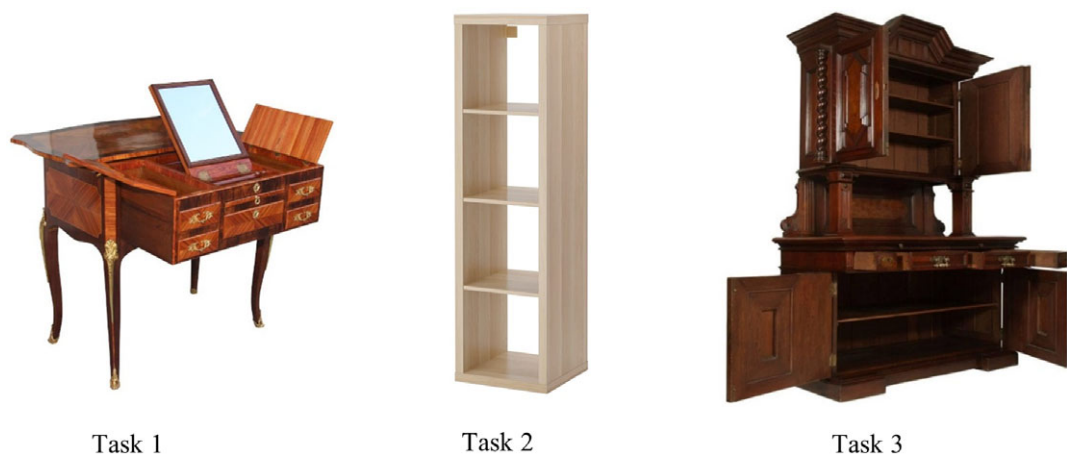
Figure 1. Presentation of the three drawing copy tasks. In task 1, the writing desk is copied with a pencil/paper. The basic task 2 (the shelf) and the complex task 3 (the buffet) are copied using Time2sketch software in a VR environment.