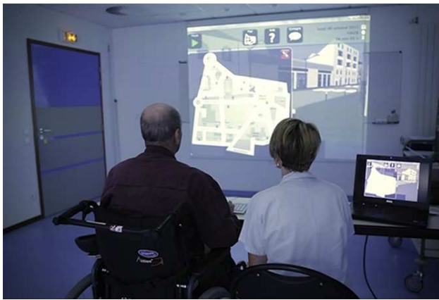
Fig. 4. Patient interacting during a therapeutic session.

of the aptitude tests. The objective was to define the optimal settings for the user point of view, the SFOV, the locomotion and rotation speeds during visual scanning, and to understand how the user estimates the distances with such parameters values. These settings are fundamental to the successful completion of tasks that are available to patients.