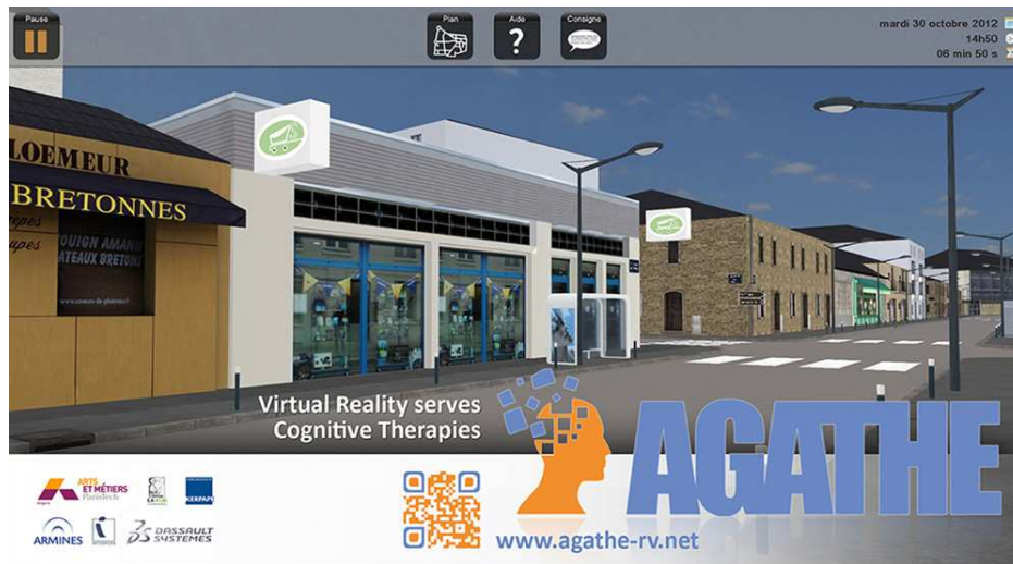
Fig. 2. AGATHE neighborhood and patient point of view.

test VR interfaces (gamepad, Kinect) and to define navigation parameters, like point of view (first or third person).