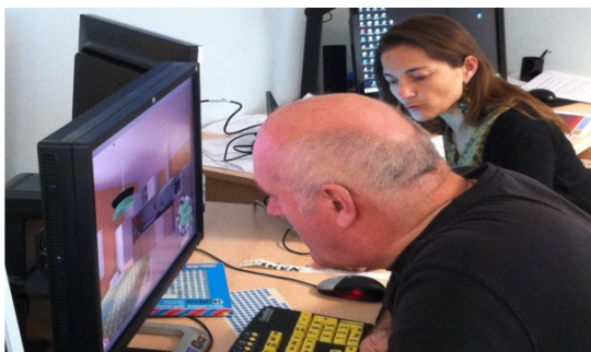
Figure 2. Experimental design: The participant in front of the screen and the evaluator on the right..

In the global visual perception step, using the mouse for visual screening, participants had to recognize in which room they were (bedroom or bathroom). If beyond 15 seconds participants did not give a right answer, the evaluator activated adaptations: reduction of lighting at first, substituted by addition of contrast if the answer was always bad, and finally both together. The exposure timing of 15 seconds was decided by the therapists according to their knowledge of low vision behaviors.